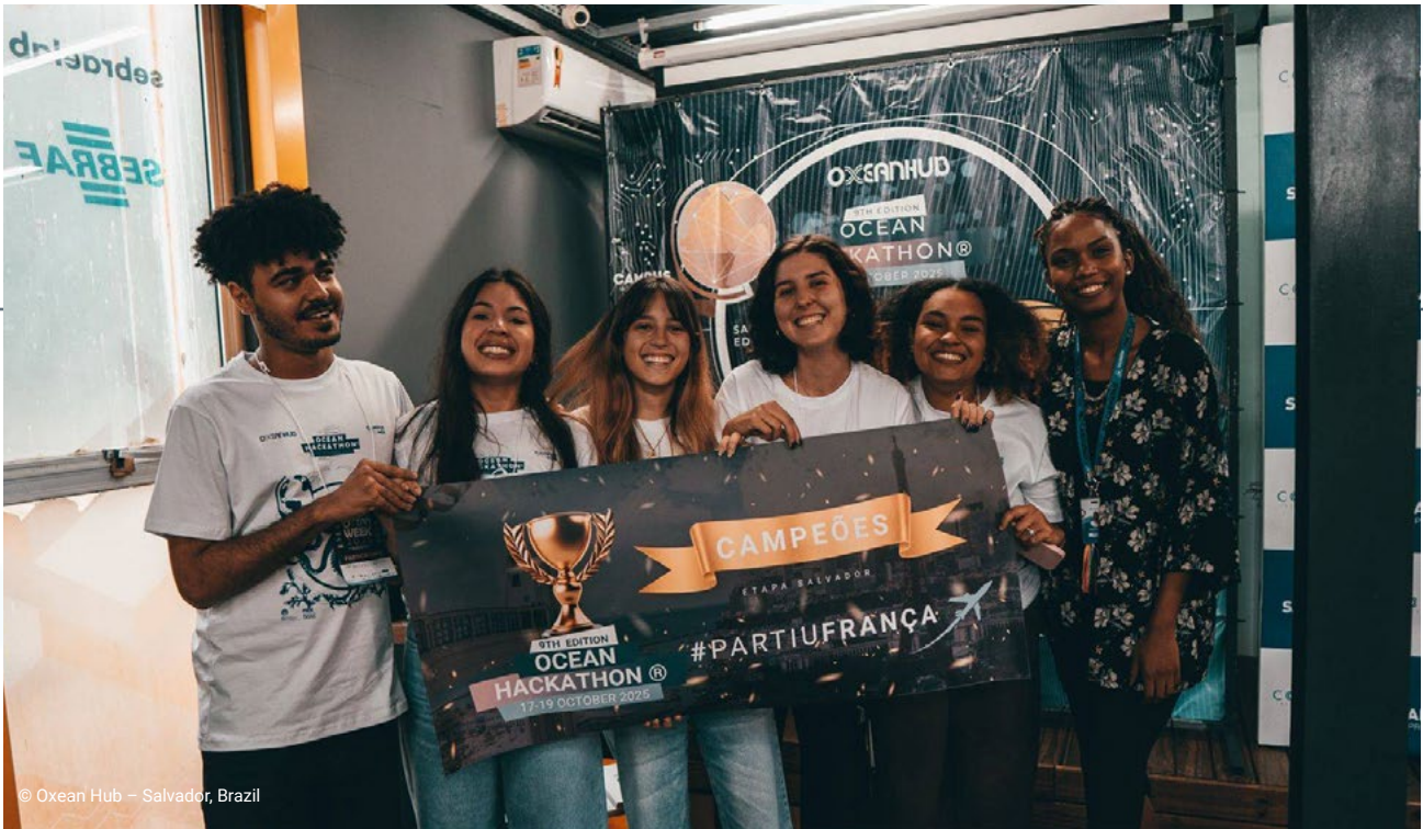
© Oxean Hub – Salvador, Brazil

The Nautilus team developed a pioneering regenerative financing platform aimed at the Blue Carbon market. By leveraging Blockchain-based Smart Contracts, the solution ensures that every investment in mangrove restoration is fully traceable and transparent. The project evolved during the weekend into a robust digital ecosystem that addresses the «trust gap» in environmental credits, facilitating direct connections between global investors and local ecological restoration projects with verifiable impacts.