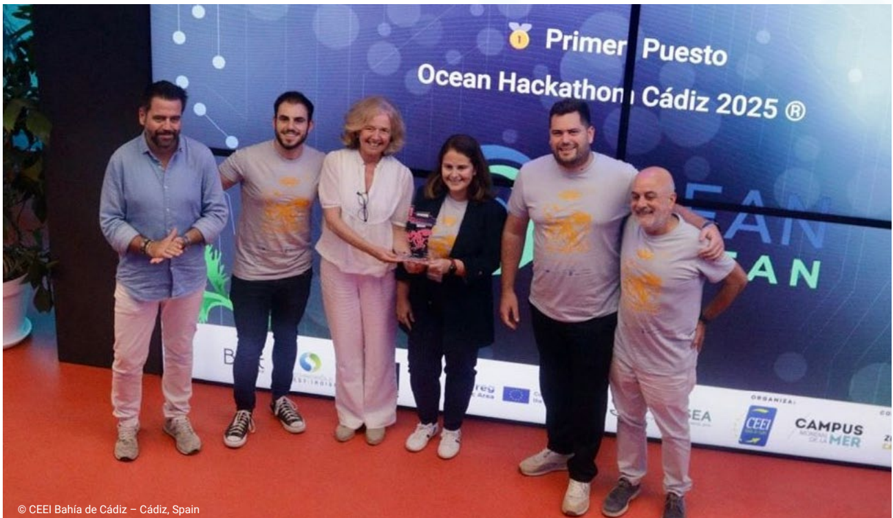
© CEEI Bahía de Cádiz – Cádiz, Spain

The proposal seeks to demonstrate that it is possible to increase the recovery efficiency of this waste from the current 15% to 75%, thus promoting innovative, sustainable management that can be replicated in other ports in the European Union.